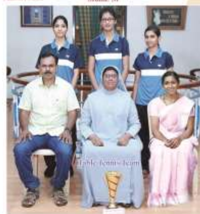
Table Tennis team