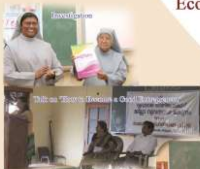
Talk on Poverty Eradication & Good Entrepreneurship