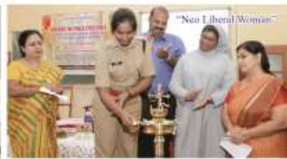
"Neo Liberal Woman"