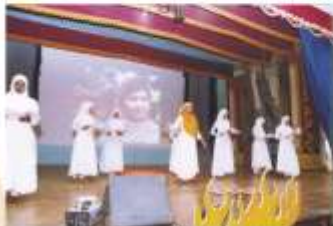
Workshop on Malala Yousafzai