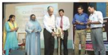
Civil Service Club Inauguration