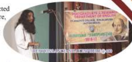
Research Guide & won the prize in the "Mission Vision Competition"