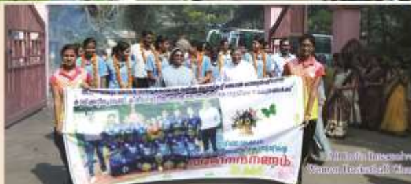
All India Inter University Women Basketball Championship