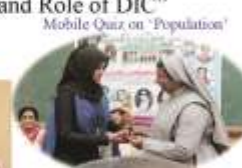
Mobile Quiz on "Population"