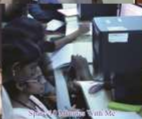
Spare 10 Minutes With Me