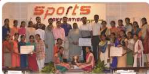
'Best College in Sports' in the University of Calicut & 'Women Aggregate Championship'