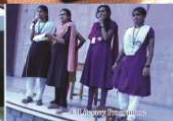
Life Orientation cum Skill Development