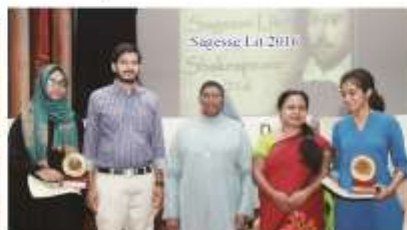
Sageesse Lit 2016