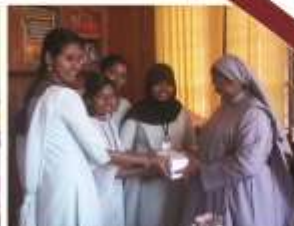
Fund Collection for Blind Orchestra