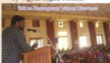
Talk on Contemporary Literary Discourses