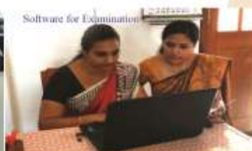
Software for Examination