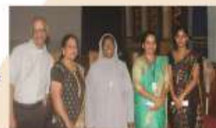
Suicidal Prevention Among College Students