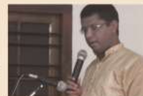
Invited Talk Govt. Policies