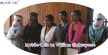
Mobile Quiz on William Shakespeare