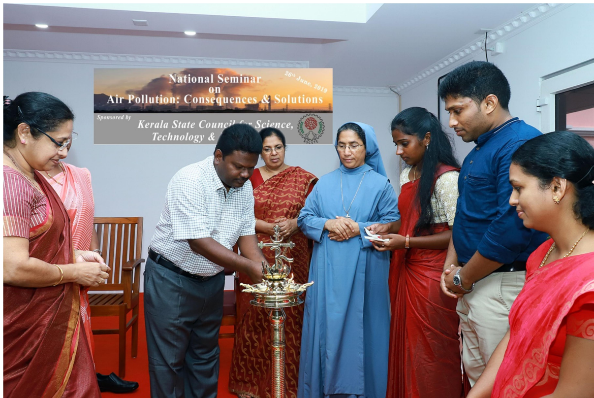
Inauguration of the National Seminar